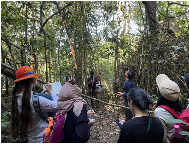
SDSU and Hasanuddin University students practicing recording behavioral data on moor macaque monkeys, Sulawesi, Indonesia.

National Science Foundation: "The Human-primate Interface: Negotiating Risks and Rewards in Anthropogenic Landscapes," $329,849