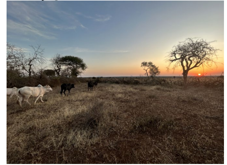
The sun setting in Sukuro Simanjiro, Tanzania, as cows head back to their boma for the evening.