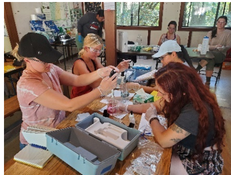
Students took water samples from multiple tributaries of the Eel River and analyzed them for water quality and water chemistry. More samples are going back to the Sacramento State lab for further analysis.

California State University Office of the Chancellor: "Developing a Diverse Hydrology Workforce Through an Undergraduate Hydrological Research Experience in a Coastal California Watershed," $96,986