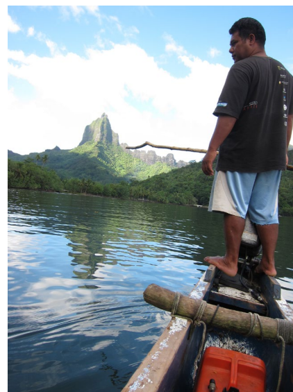
A local fisherman on Opunohu Bay, Polynesia.

University of California at Santa Barbara: “Understanding Dynamic Social-environmental Feedbacks in Temporary Fisheries Closures,” $130,929